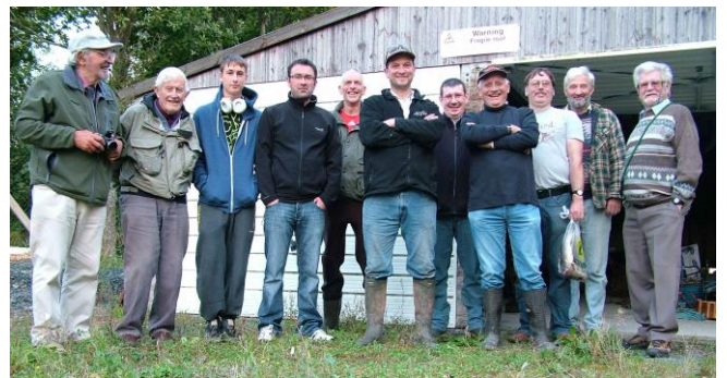
A good turnout on Rivers Day