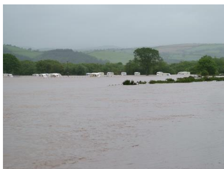
Floating Caravans at Glanyravon

June was exceptionally wet with 148mm recorded at Aberporth, and in the second week of June, we had exceptional rainfall which proved to be too much for the river system as evidenced from the photos below.