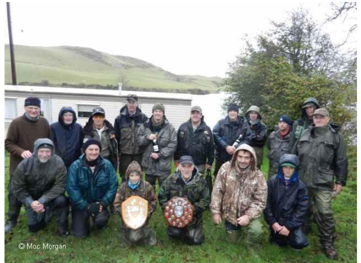
Soaked but still smiling!