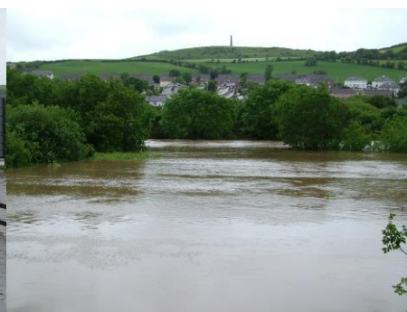
Big River Below Morrison's