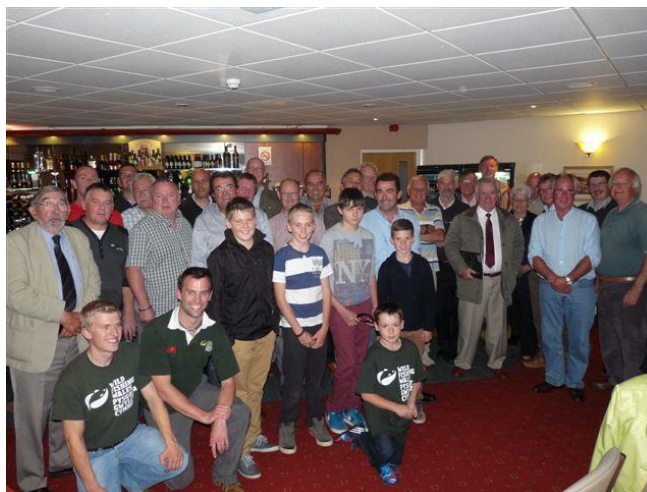
Over thirty anglers and EA officers attended the launch