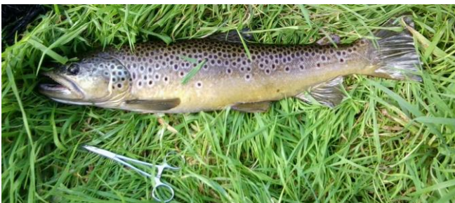
Brown Trout 23.5" long and weighing over 4lbs from the Rheidol

A number of large brown trout weighing three pounds and over were caught on the Rheidol last season which has sparked some debate as to whether they should be culled or returned to water. Large trout are known to be ferocious, carnivorous predators, consuming a large number of smaller fish which ultimately may be to the detriment of the rivers ecosystem, by drastically reducing the number of small trout and fry.