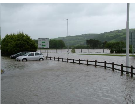
Lletty Parcs new water feature!